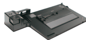
ThinkPad Mini Dock Plus Series 3 (170W) (4338-30U)