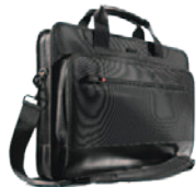
ThinkPad Business Topload (43R2476) ThinkPad Business Backpack (43R2482)